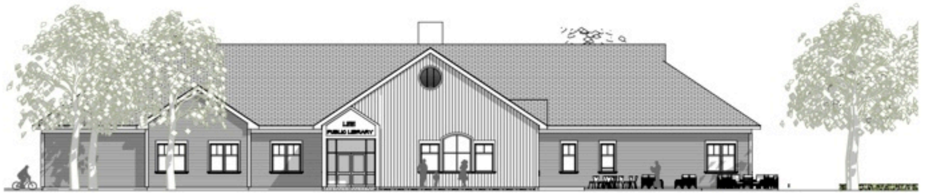
Front/North + Community Rm