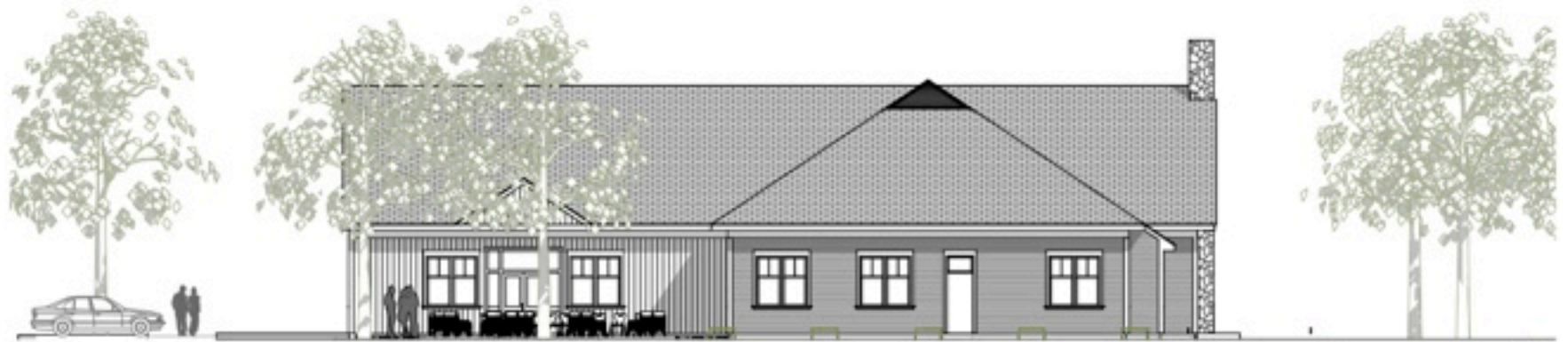
Side/West + Community Rm