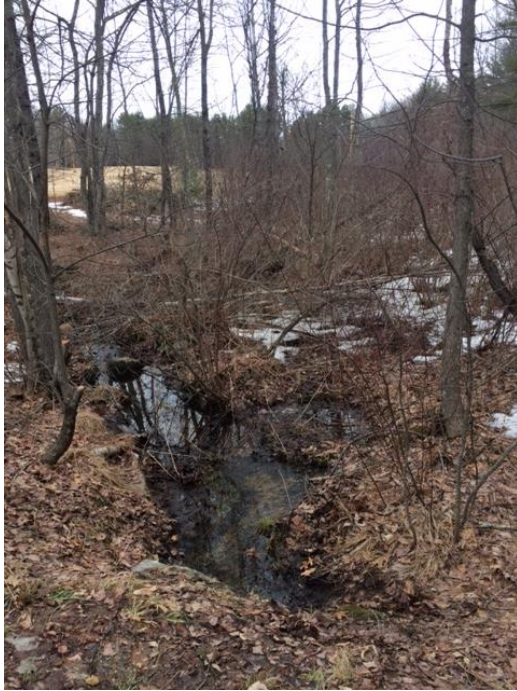
Thompson Mill Rd. - #1 15"x50' Inlet