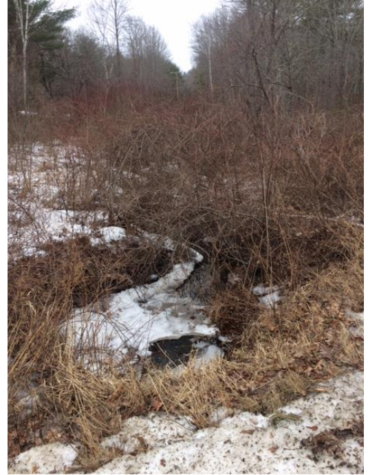
Thompson Mill Rd. - #1 -15"x50' Outlet