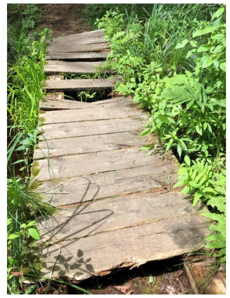
Old Bridge

The result is a sturdy new bridge that will last many years! Thanks to all the Trails Committee members who helped and everyone who has been cheering us on!