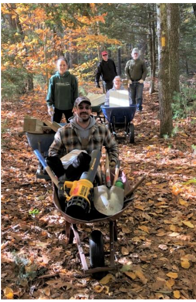
Moving materials