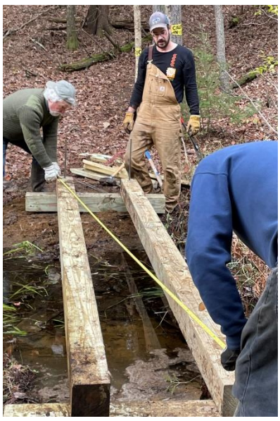
Measuring for new bridge