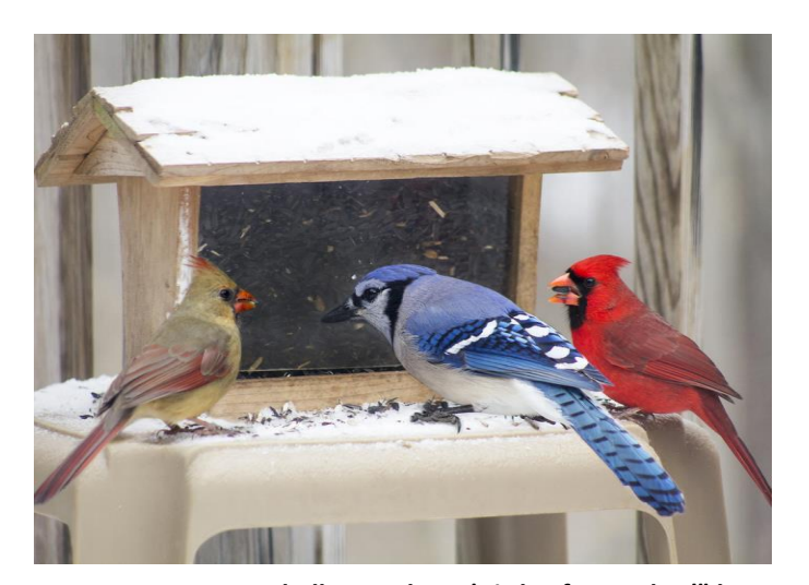
January 2016 Art Challenge Photo 'Birds of a Feather'" by COLORED PENCIL magazine is licensed under CC BY 2.0

website here: <a href="https://feederwatch.org/about/">https://feederwatch.org/about/</a>