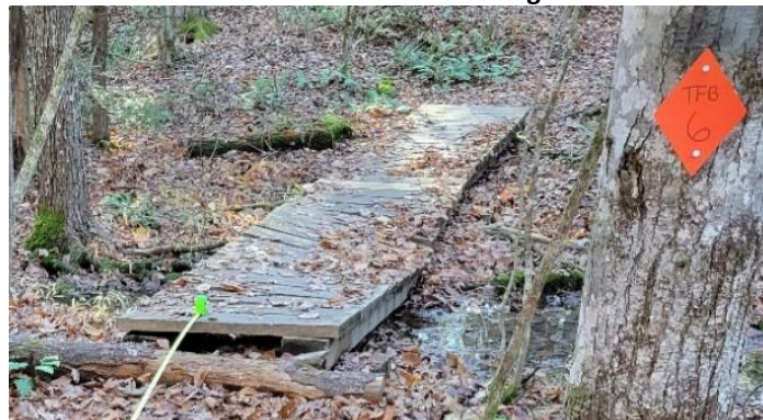
Bridge #6 Before