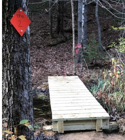
Bridge #2 After