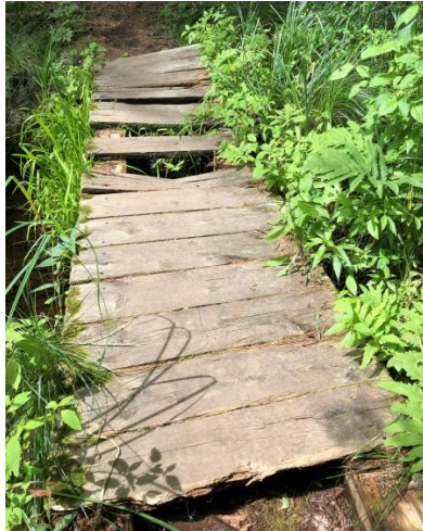
Bridge #2 Before