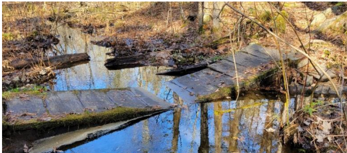
Bridge #4 Before