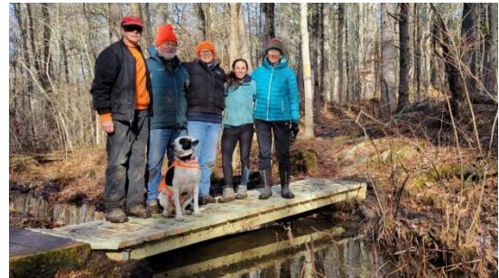
Bridge #4 After