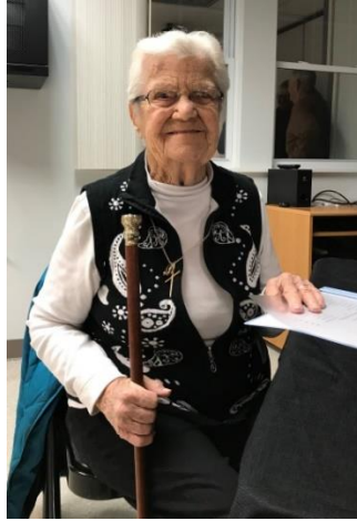
November 1, 2018