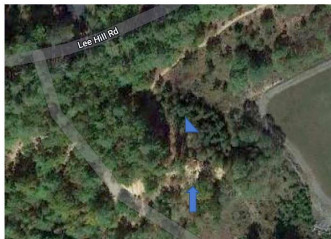
The yellow highlights the Mills parcel. Blue arrow points to the steepest slope with the most severe erosion. Blue triangle points to the very thick treed area that could benefit from a thinning of understory trees.