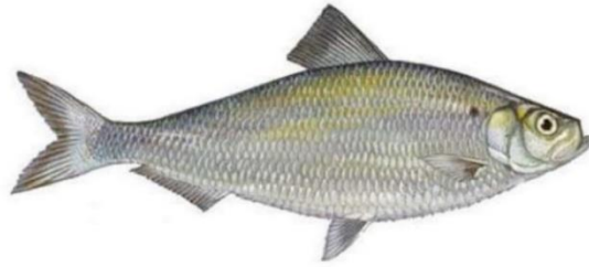
alewife Alosa pseudoharengus