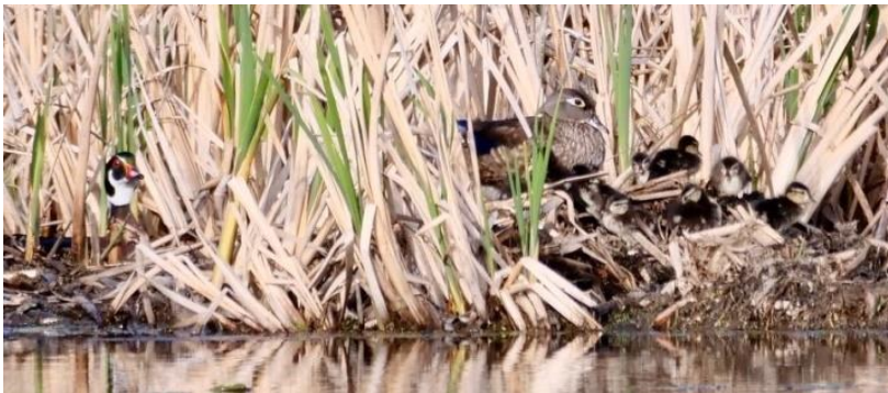
Wood duck and ducklings.

Birds were plentiful throughout the walk with robin, phoebe, red-winged blackbird, ovenbird, chickadee, northern parula, red-bellied woodpecker, common yellowthroat, brown-headed cowbird, chipping sparrows and swamp sparrow seen or heard. Near the end of our walk, as we approached the North River, a female wood startled us by suddenly darting across our path and then running along the forested riverbank. Holding her body outstretched and low to the ground, with her feathers puffed out, tail feathers spread, and wings held low and somewhat away from her body, she barreled along the edge of the steep embankment for several yards, before racing down and into the river where she continued to hold her body in the same outstretched position, paddling furiously along the surface of the water and roiling things up quite a bit. At that point, loud peeping downstream from where the duck had re-entered the water, alerted us to the fact that this duck had youngsters, six of them.