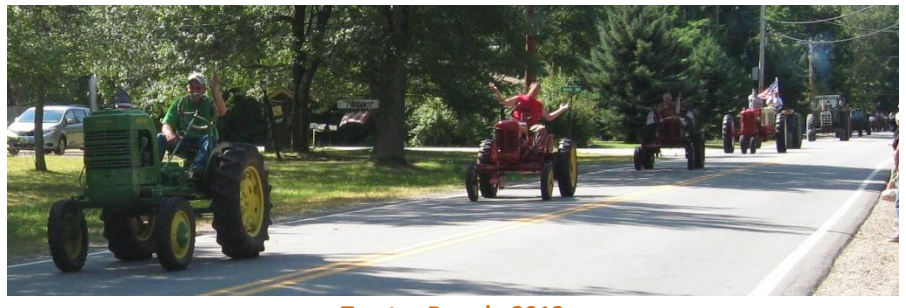
Tractor Parade 2013