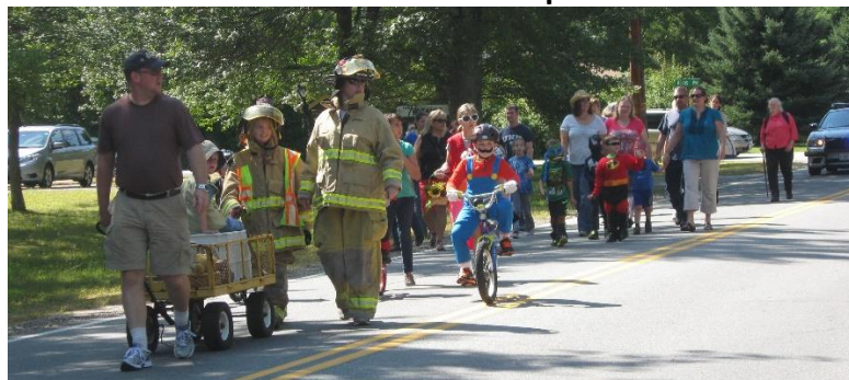
Children's Parade 2013

Pig Roast and Chicken BBQ 5:00 – 6:30pm Ice Cream Smorgasbord 5:45 – 8:00pm ($7 for adults and $4 for kids) Fireworks 8pm